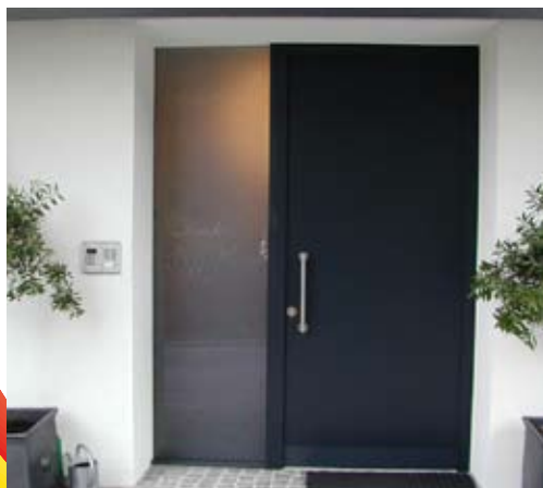
Frostkorken with side panel